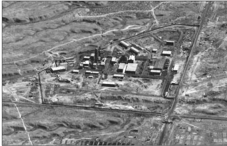
FIGURE 2: AL-SHARQAT CHEMICAL PRODUCTION FACILITY

For example, Iraq has built a large new chemical complex, Project Baiji, in the desert in north west Iraq at al-Sharqat (see figure 2). This site is a former uranium enrichment facility which was damaged during the Gulf War and rendered harmless under supervision of the IAEA. Part of the site has been rebuilt, with work starting in 1992, as a chemical production complex. Despite the site being far away from populated areas it is surrounded by a high wall with watch towers and guarded by armed guards. Intelligence reports indicate that it will produce nitric acid which can be used in explosives, missile fuel and in the purification of uranium.